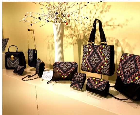
Figure 1 Exhibition of outstanding graduates of the Fine Arts Department

For relevant educators, it is necessary to consider the application of traditional arts and crafts in modern art design education. Only by combining traditional arts and crafts with modern art design education can we enhance the effect of art design education, in order to inherit and carry forward traditional arts and crafts, and boldly innovate modern art design [1] . Figure 1 shows students integrating traditional arts and crafts into their own art design works.